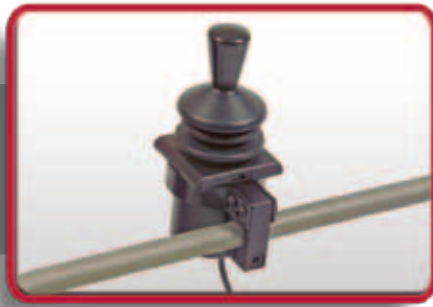
ASL 132 Pediatric Compact Joystick