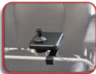
ASL 603C Driving Platform Joystick Mount for Pediatric Compact Joystick