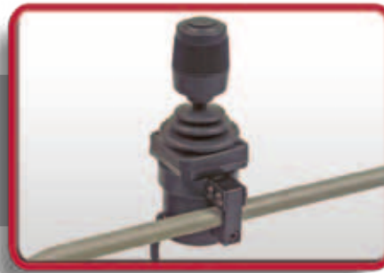
ASL 133 Compact Joystick - Single