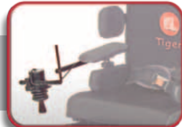
ASL 616A Pediatric Midline Mount - Flipped Away