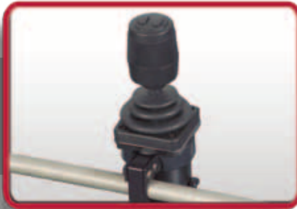
ASL 134 Compact Joystick - Dual