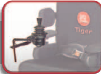
ASL 616A Pediatric Midline Mount