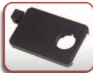
ASL 603C Driving Platform Joystick Mount for Pediatric Compact Joystick - without Joystick