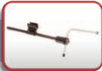
ASL 616 Gatlin Mount