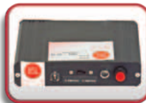
ASL 151 PGC Multi Switch Interface for PG R-Net or Curtis