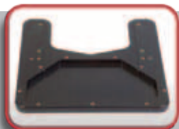
ASL 601 Full Lap Tray Back