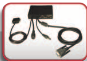
ASL 156 Multi Switch Interface Back with ECU