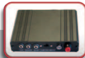
ASL 156 Multi Switch Interface with ECU