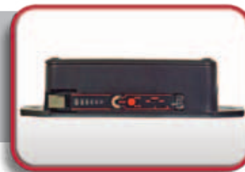
Adjustments and Settings