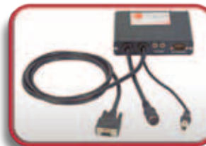
ASL 151 PGC Multi Switch Interface Back for PG R-Net or Curtis