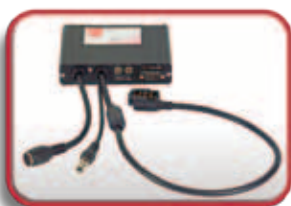
ASL 151 MK6i Multi Switch Interface Back for MK6i