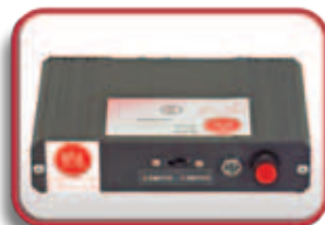
ASL 151 MK6i Multi Switch Interface for MK6i