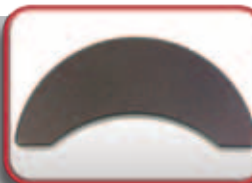
ASL 619 Eclipse Tray Front