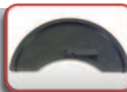
ASL 619 Eclipse Tray Back