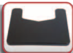
ASL 601 Full Lap Tray Front