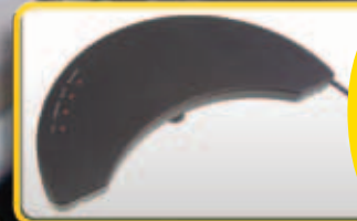
PASL 107-108 Fiber Optic Array

ASL designs products specifically for those who can not access their environment through conventional means. Our products and designs are a direct result of the needs of those we serve. Our goal has always been independence and equal rights for those we work with.