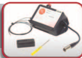
Switch and Illumination Box