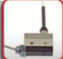
ASL 304B Medium Pressure Wobble Switch