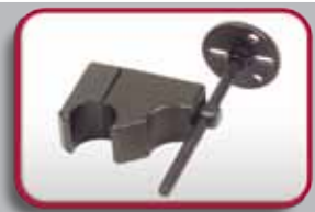
ASL 611 Armrest Switch Mounting Bracket