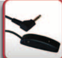
ASL 314 Ultra Light Switch