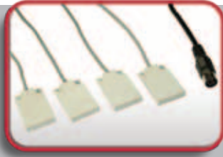
4 x ASL 208 Proximity Sensors Included