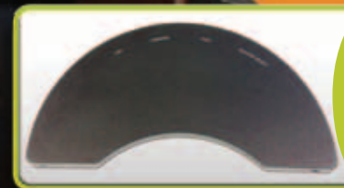
PASL 106 Proximity Tray Array

ASL designs products specifically for those who can not access their environment through conventional means. Our products and designs are a direct result of the needs of those we serve. Our goal has always been independence and equal rights for those we work with.