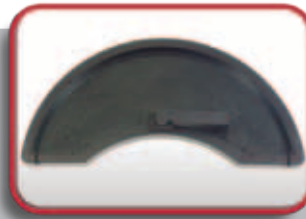
ASL 619 Eclipse Tray Back