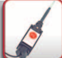
ASL 304A Light Pressure Wobble Switch