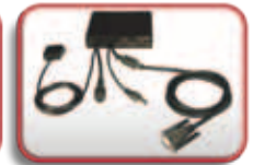
ASL 156 Multi Switch Interface Back with ECU