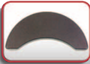
ASL 619 Eclipse Tray Front