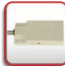
ASL 208 Adjustable Proximity Sensor