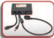
ASL 151 MK6i Multi Switch Interface Back for MK6i