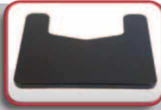
ASL 601 Full Lap Tray Front