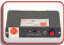
ASL 151 MK6i Multi Switch Interface for MK6i