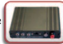
ASL 156 Multi Switch Interface with ECU