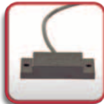
ASL 204 Non Adjustable Proximity Sensor