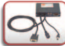
ASL 151 PGC Multi Switch Interface Back for PG R-Net or Curtis