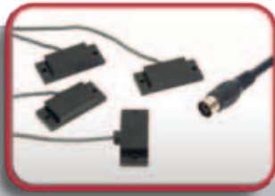
4 x ASL 204 Proximity Sensors Included