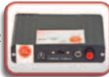
ASL 151 PGC Multi Switch Interface for PG R-Net or Curtis