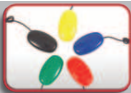
ASL 300 Egg Switch