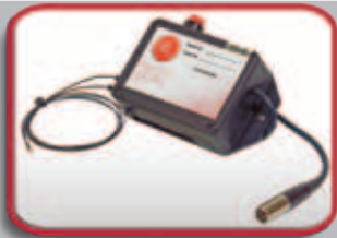
ASL 203 Mini Fiber Optic Switch