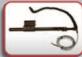
ASL 618 FO Flexible Fiber Optic Switch Arm Rest Mount