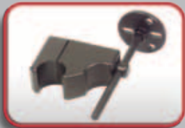
ASL 611 Armrest Switch Mounting Bracket