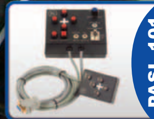
PASL 101 Single Switch Scanner

ASL designs products specifically for those who can not access their environment through conventional means. Our products and designs are a direct result of the needs of those we serve. Our goal has always been independence and equal rights for those we work with.