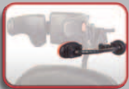
ASL 913L Swing Away Headrest Switch Mounting Bracket (Left)