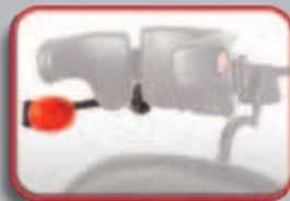
ASL 913R Swing Away Headrest Switch Mounting Bracket (Right)