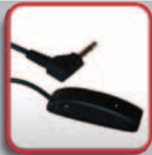
ASL 314 Ultra Light Switch