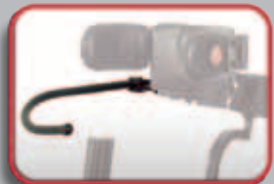
ASL 620 Fiber Optic Mount