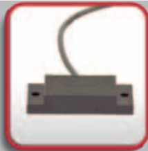
ASL 204 Non Adjustable Proximity Switch