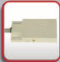
ASL 208 Adjustable Proximity Switch