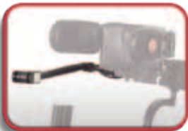
ASL 913M Specify L or R Swing Away Flex Tube with Microlite