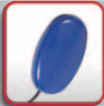
ASL 300 Egg Switch